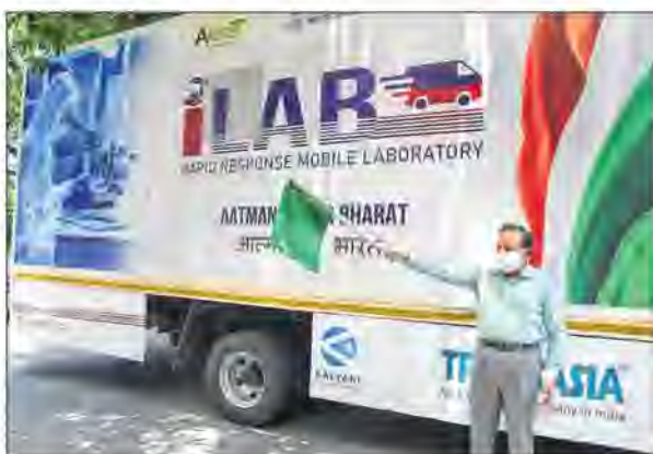
Union Minister for Health & Family Welfare, Science & Technology and Earth Sciences, Harsh Vardhan launches India's first I-Lab (infectious disease diagnostic lab) for COVID-19 testing in rural and inaccessible areas of India in New Delhi on Thursday

"It's unfortunate that the prime minister is cherry-picking parties for the all-party meet. This proves that he doesn't want to pay heed to the collective wisdom," RJD Member of Parliament Manoj Jha said.