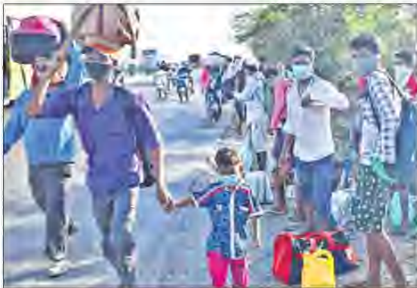
WHAT THE FINMIN SAYS

The campaign envisages 125 days of the mission mode drive to intensify and focus implementation of 25 different types of works to be provided for the migrants on one hand and create infrastructure in the rural areas with a resource envelope of Rs 50,000 crore, Finance Minister